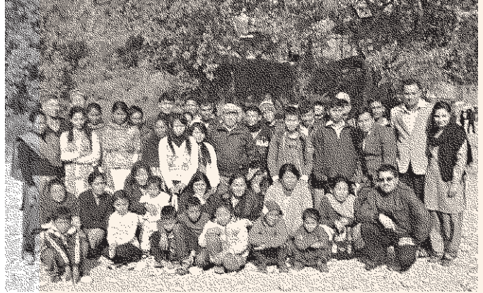
The Nepal Field reports 826 baptisms for 2011.

Evangelism funds provided through Saxton