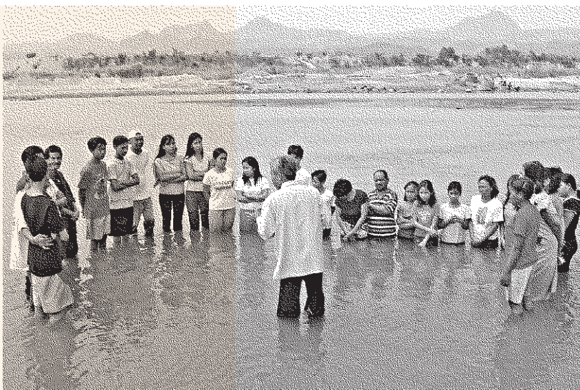
The entire world, one person at a time, must have the opportunity to hear the gospel and make a decision to follow Jesus.

However, evangelistic spending in the 10/40 Window barely qualifies as a blip—one-twentieth of 1 percent of average Christian church budgets. Out of every $100 given to churches, an estimated 5 cents reaches the 10/40 Window to tell the people there about Jesus.